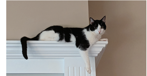
Because mosquitoes that carry heartworms can come inside, indoor cats are at risk for heartworms, too.

The best way to protect your pet against heartworms is to give the preventive year-round.