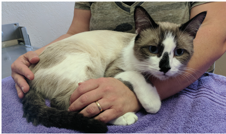
Cats with heartworms can develop serious disease and even die.

If even one or two heartworms survive to adulthood, a cat can develop serious disease and die. Signs include severe breathing distress, as well as blindness or seizures.