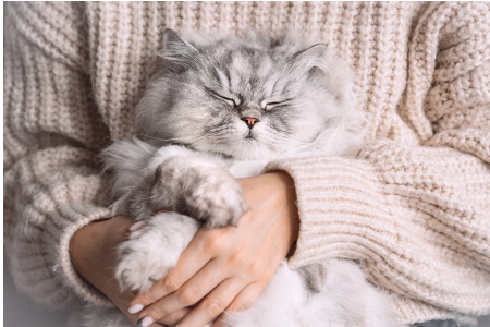
Keeping cats on year-round heartworm prevention is one of the best ways to show you love them.

Heartworm preventives for cats have the added benefit of also protecting cats from other common parasites.